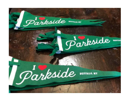
PCA Pennants 1 for $15 2 for $25